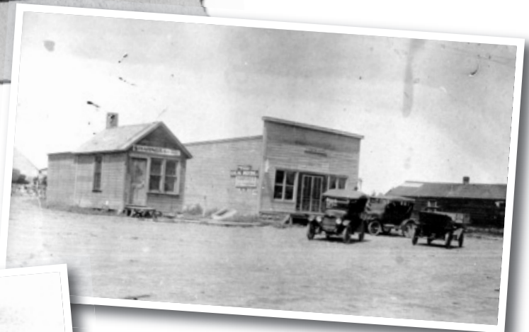
Part of Hamill SD - Early 1900's