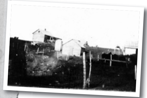
Nels & Sena Larsen homestead site