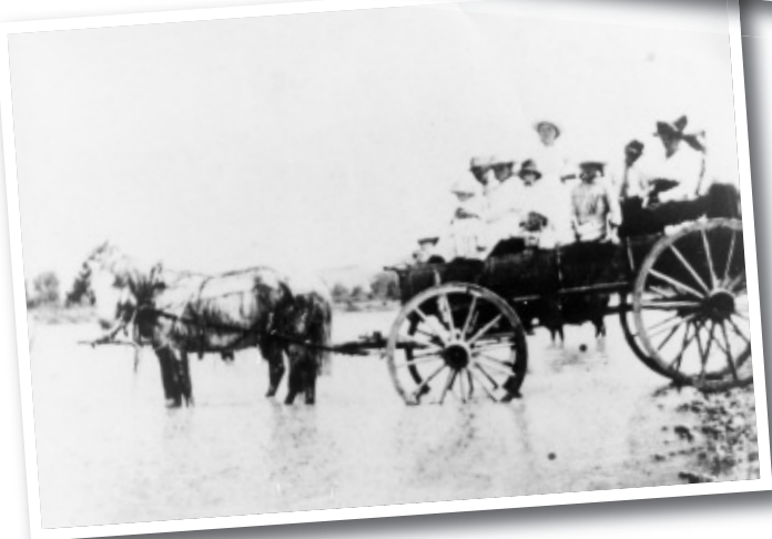
The Nels Larsen family crossing the White River – Early 1910's