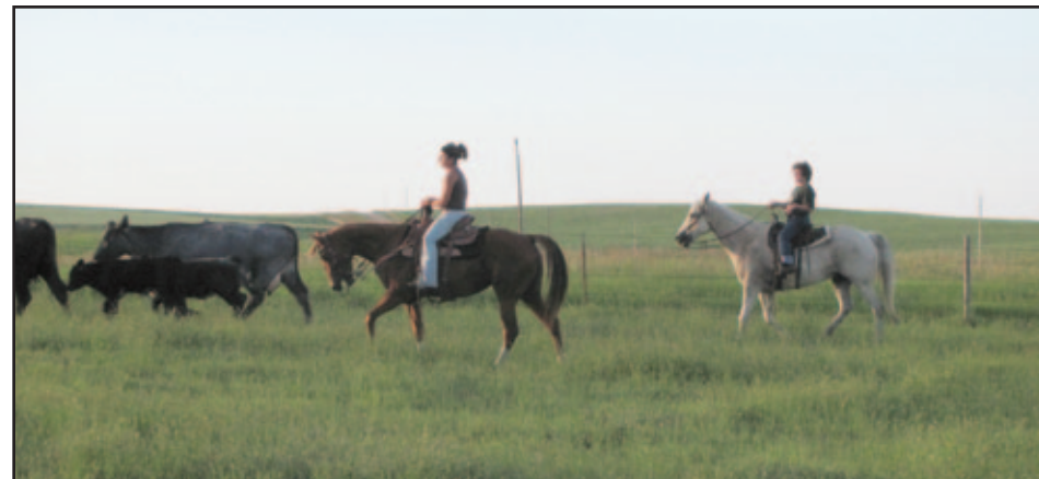
Moving cattle on the Larson Ranch.