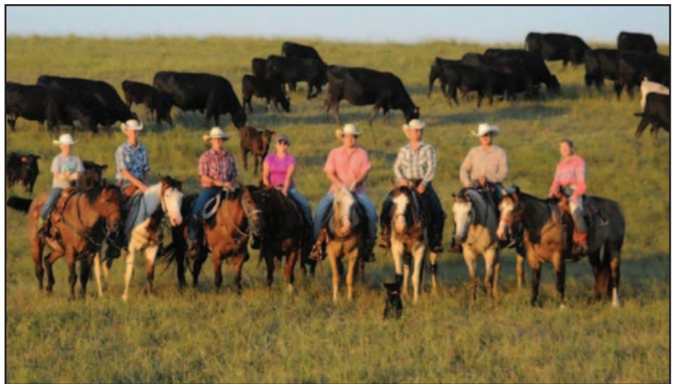
Part of the Larson Crew